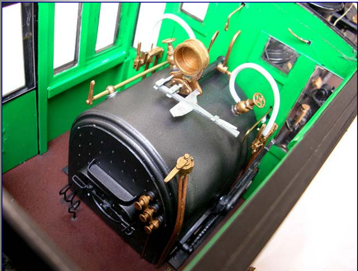
Backhead shell is built, pipes and backhead appliances are chapter 7 work.