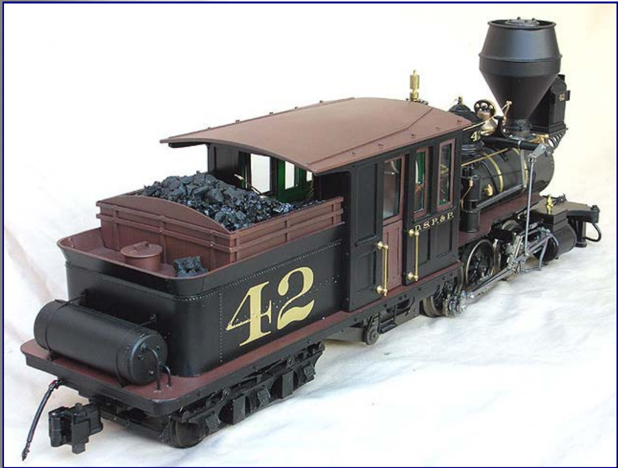
She runs like a dream, and has no trouble pulling 3 of the Carter Cars up a 4% grade.