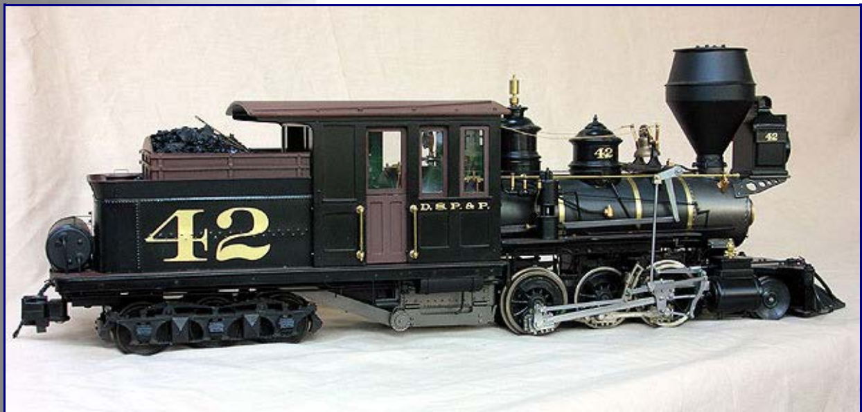
#42 Paint scheme, taken from 1885 Union Pacific Specs, as provided by Jim Wilke. The decals were designed and produced by Stan Cedarleaf.

Check out these 2 movie clips of the vavle gear in motion, [ movie clip #1 ] - [ movie clip #2 ]