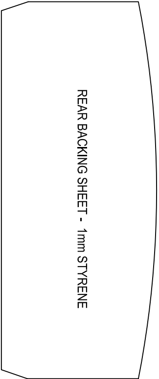
REAR BACKING SHEET - 1mm STYRENE