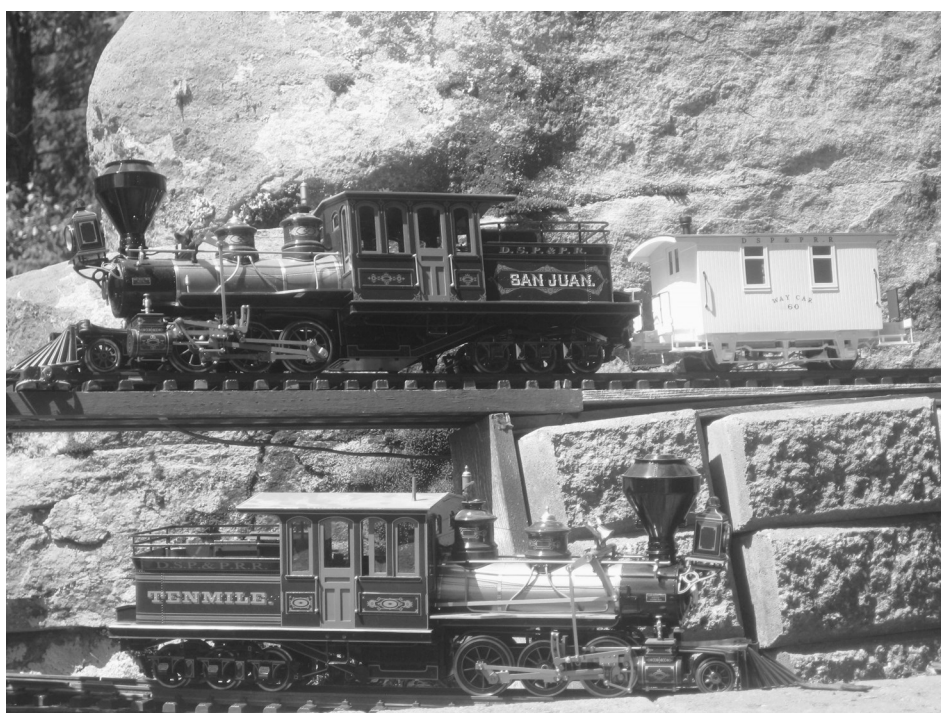
"San Juan" and "Tenmile" on the author's outdoor railway

The body of the model is built from heavy brass with steel drivers, side rods, and linkage. The engine swivels under the boiler and the center drivers are blind, just as on the full scale Mason Bogies that were delivered to the DSP&P in 1879. The level of detail is excellent, especially the Nesmith smokestack, domes, headlight, pilot, and rivet patterns. Paint and lettering, especially the stripes and decorative flourishes, are superb. All four doors are spring loaded and one window on each side slides open.