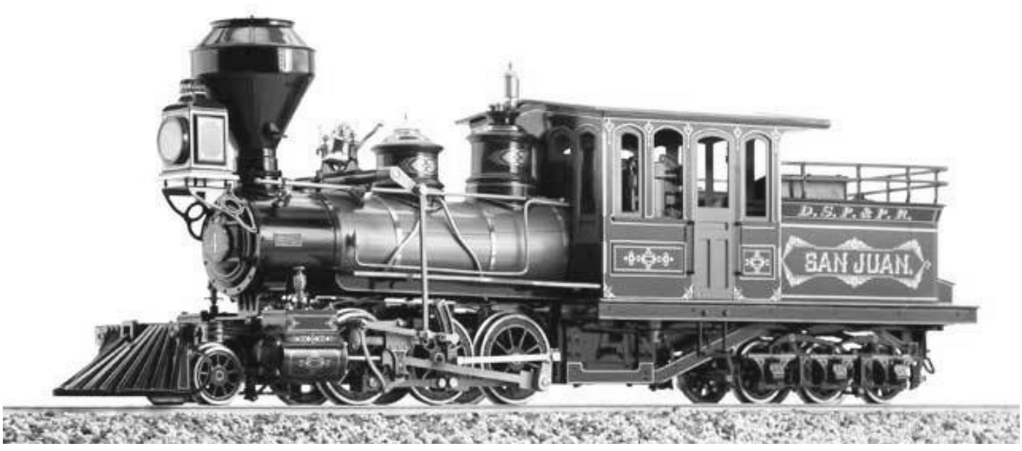
Builder's photo of DSP&P #4 "San Juan"